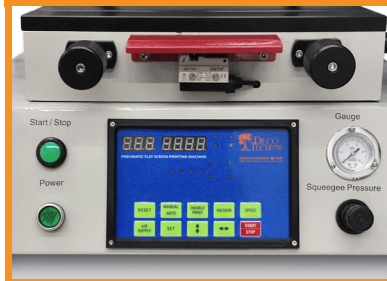
Close Up View of the Control Panel with Membrane Switches & LCD Display