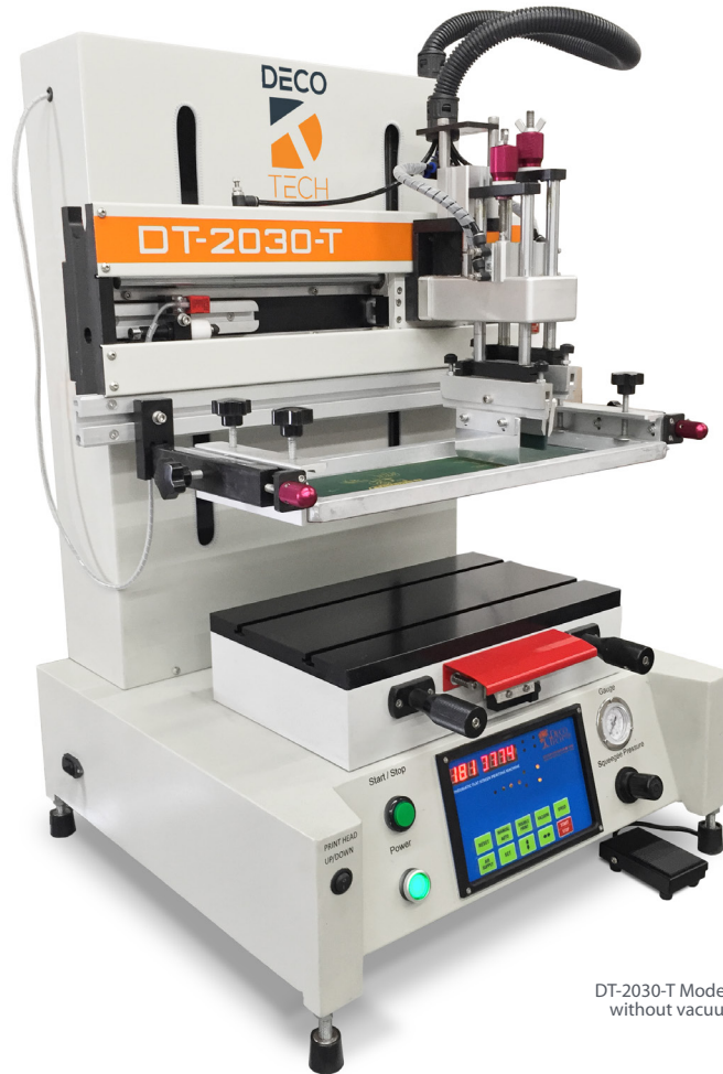
DT-2030-T Model is shown without vacuum table.

SEMI-AUTO SMALL FORMAT FLAT-BED SCREEN PRINTING PRESS